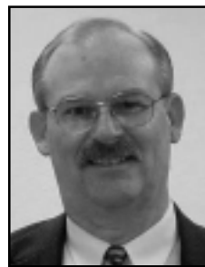
Monte Barnes Bowie ISD