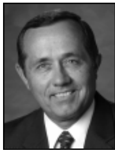
Kirk London Hays CISD